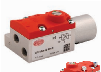
Shown with optional apple core mount

This compact Venturi Vacuum Generator is optimized for mounting on DE-STA-CO's end-effector systems and is available in two mounting orientations. The integrated air-saving function switches off the vacuum once a defined level is reached and reactivates vacuum when needed to maintain its grip on the part. This allows for significant reduction of costs related to the consumption of compressed air and preventative maintenance.