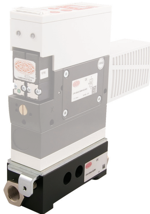
Optional quick-change base.