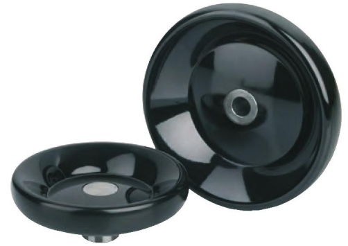
Style D Pilot Hole